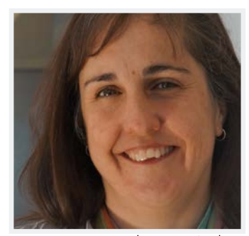
Finding Your Niche: An Australian Nanny