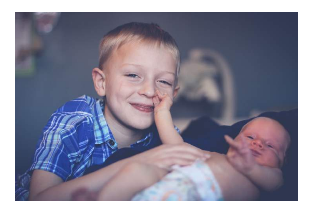
BY CHELSEY BAHE

For a child who is about to become a big brother or big sister for the first time, this happy occasion can also come with challenges. Whether the family is growing through birth or through adoption, there are several ways a nanny can help prepare a singleton charge for the changes ahead.