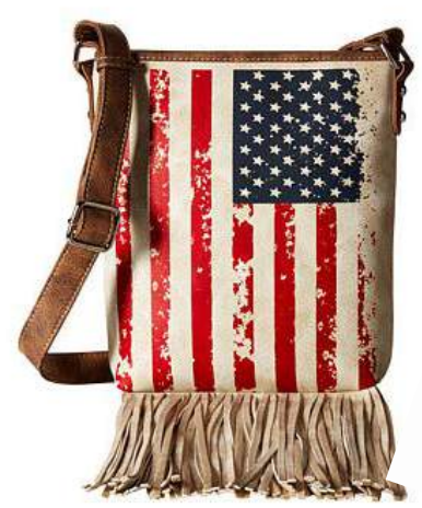
M + F Western Americana Messenger Bag, $45 at zappos.com